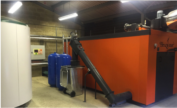
(600kW biomass boiler with 5,000 litre buffer tank)

A 370 Lauber Lenz unit was utilised along with four drying containers to dry wet firewood logs from 50 – 60 % Moisture content down to a seasoned 18 – 20 % Moisture content every five days.