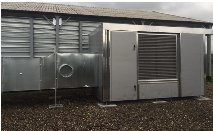
(370 Lauber Lenz Unit)